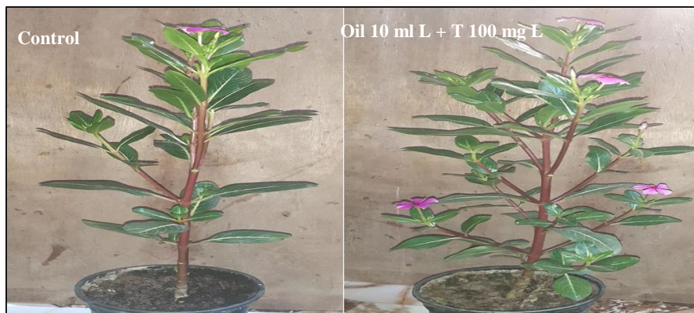
FIGURE 1. Effect of spraying with rapeseed oil and tryptophan on the number of vegetative branches in Periwinkle plants.